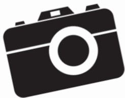
Photo and entry form must be received by 4:30PM on April 29, 2022.

Return to the Parks & Recreation Office at Town Hall, 1 Collyer Lane, Basking Ridge.