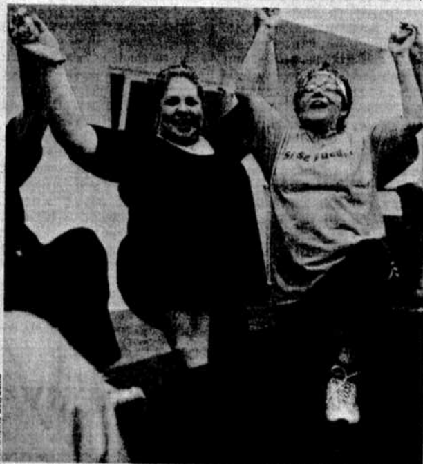
Women exercise in a class in Sacramento, Calif., during late February.

The results suggest even strict adherence to a diet won't matter if people's diets are out of synch with their genetics, he added.