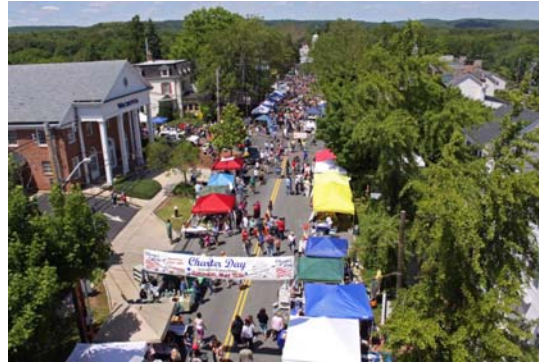
The Liberty Corner Fire Co, which is celebrating its 100 th anniversary this year, used its 100 foot reach bucket truck to enable the creation of this birds-eye view of Charter Day 2010.

This is a handmade cabinet with Lenni Lenape artifacts found at the site of the present Verizon Headquarters on North Maple Avenue. Included are arrowheads, spearheads, hammer stones, axes and grinders. These artifacts were donated by the Corbett family, and can be found in the lower level of the Brick Academy.