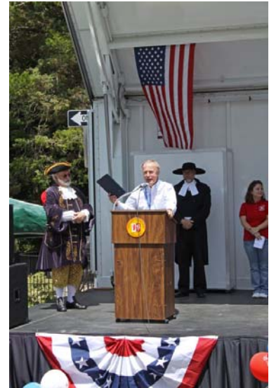
Congressman Rodney Frelinghuysen reads the resolution in honor of our 250th Anniversary. This resolution was read aloud into the Congressional Record of the U.S. House of Representatives on May 18, 2010.