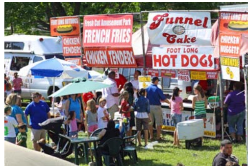
Vendors and attendees at the booths and stands filling the grounds of Oak Street Elementary School.